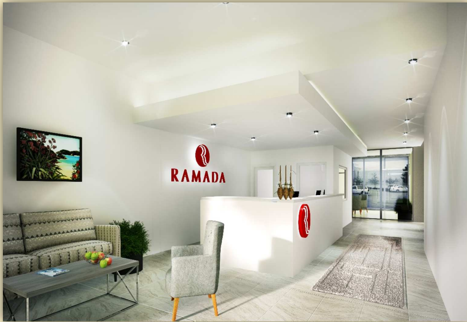
RAMADA ALBANY, AUCKLAND